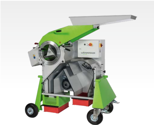
Chassis with 4 wheels