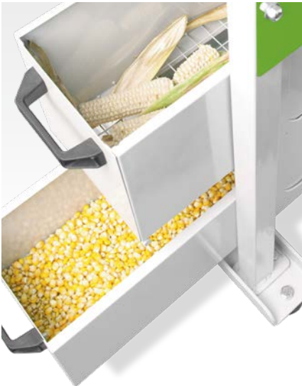
Collection container and kernel drawer