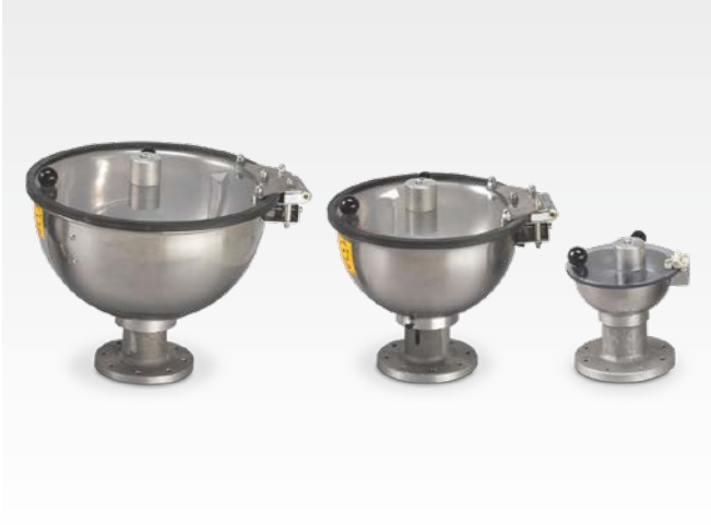
Seed bowl small - medium - large