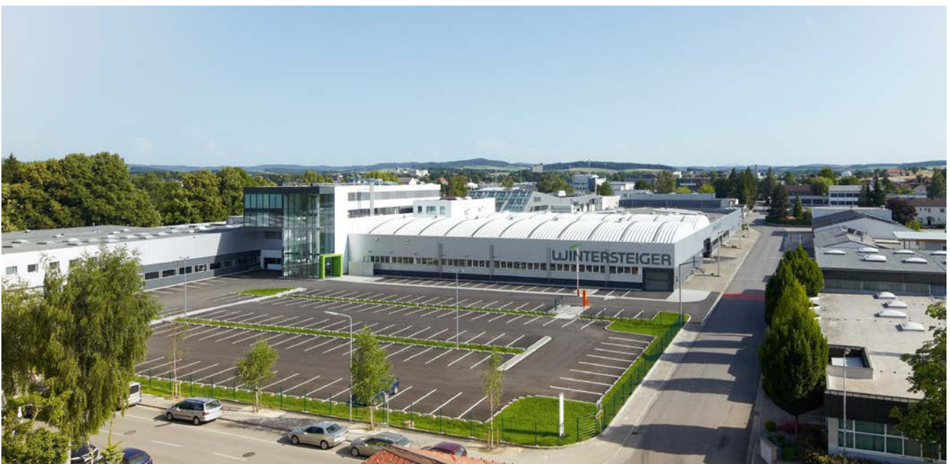
Headquarters at Ried im Innkreis, Upper Austria