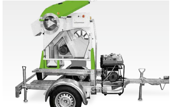
Single axle trailer with light