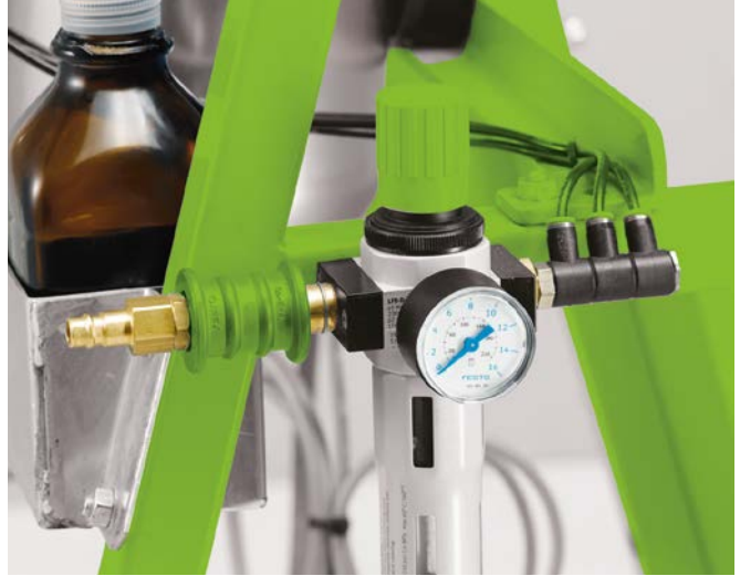
Option: Air-operated unit