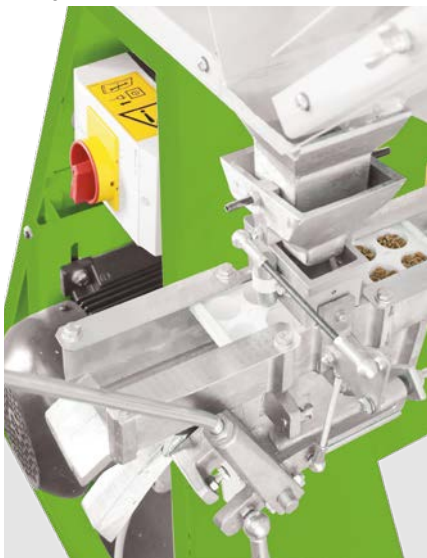
Option: Magazine hopper