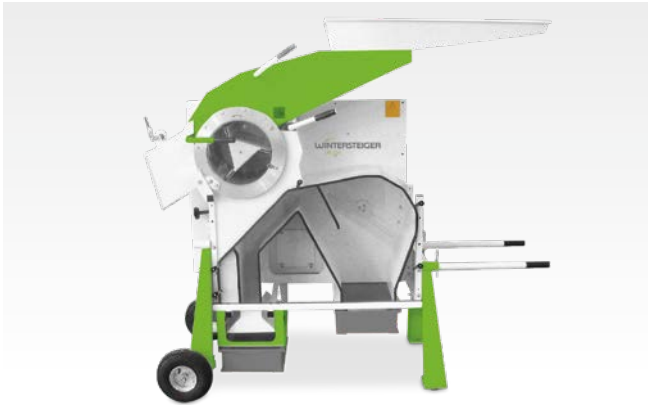
Chassis with 2 wheels

The following mobile versions of the WINTERSTEIGER LD 350 are available: