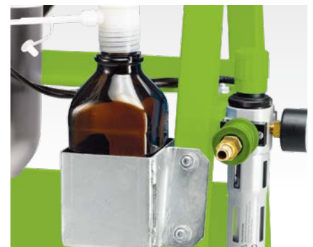
Dispensette with brown glass bottle