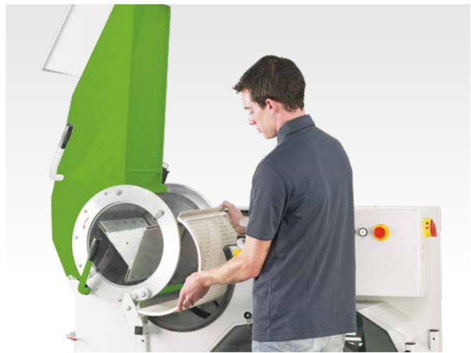
Changing the threshing basket